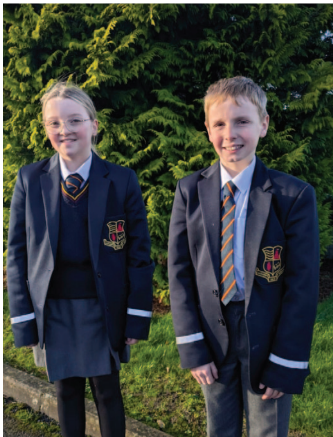
Castlederg High School Uniform