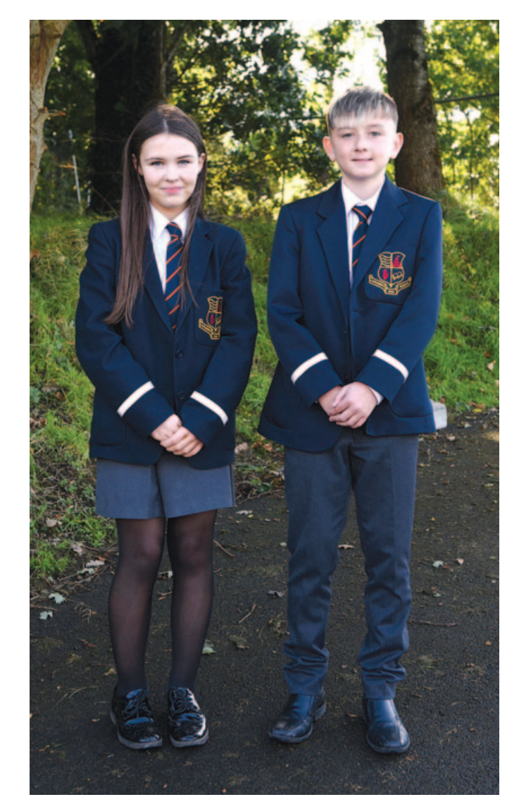
Castlederg High School Uniform