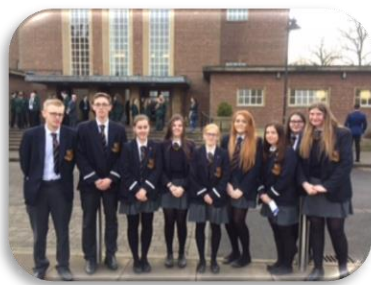
Students visiting QUB Maths and Finance faculties

AS or A Level Maths consolidates and extends the knowledge, skills and understanding developed in Key Stage 4. It helps build a suitable foundation for further study and a wide range of interesting careers.